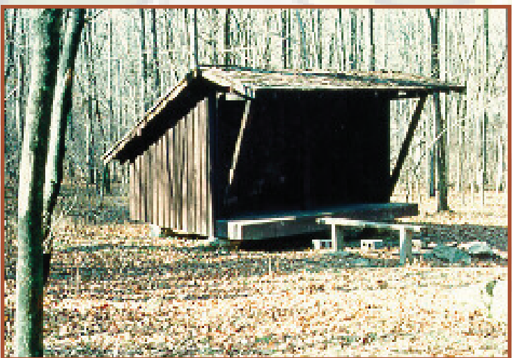
Typical Adirondack/Backcountry Camping

It is recommended that the County explore the feasibility of developing and maintaining an RV park on the site. Nearby John Tanner State Park has an existing RV facility, but the Little Tallapoosa park would provide additional accommodations if RV use increases and demand for these campgrounds grow. The character and types of support facilities that are proposed for Little Tallapoosa may also encourage RV campers to this park. A camp store, restrooms with showers and RV dump station will be essential components of both the developed campground and the RV park. These structures should be designed to have a finished yet rustic character that enhances the visitor’s experience at the park.