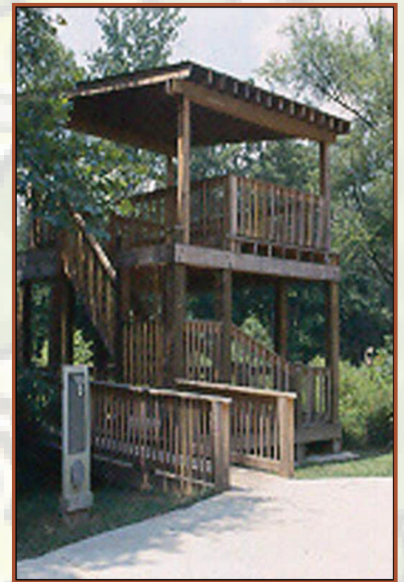
Typical Observation Tower