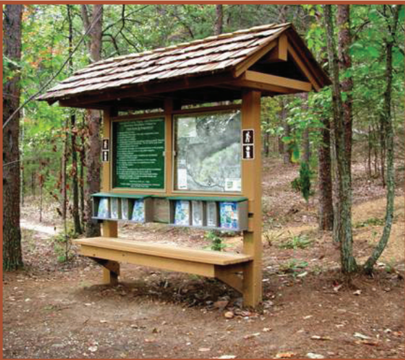
Typical Trail Kiosk