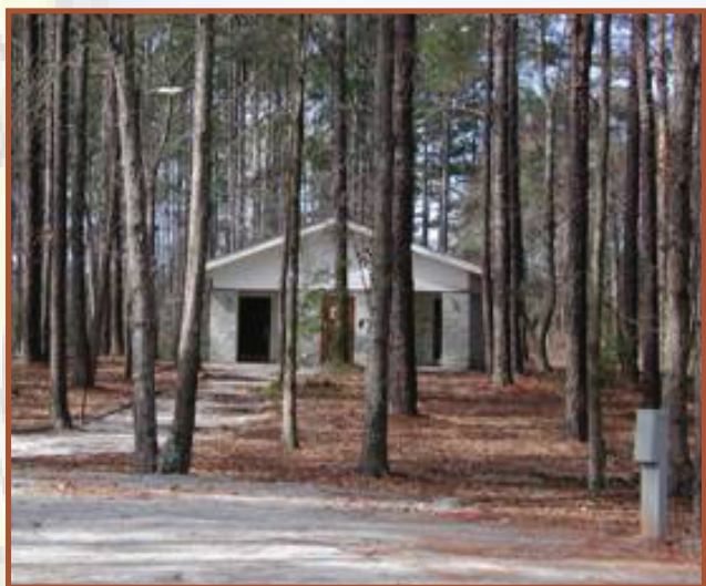
Typical Restroom Facility

In addition to the organized campground, the Park will allow primitive backcountry camping along the hiking trails for those campers wanting a more serene nature experience. Several