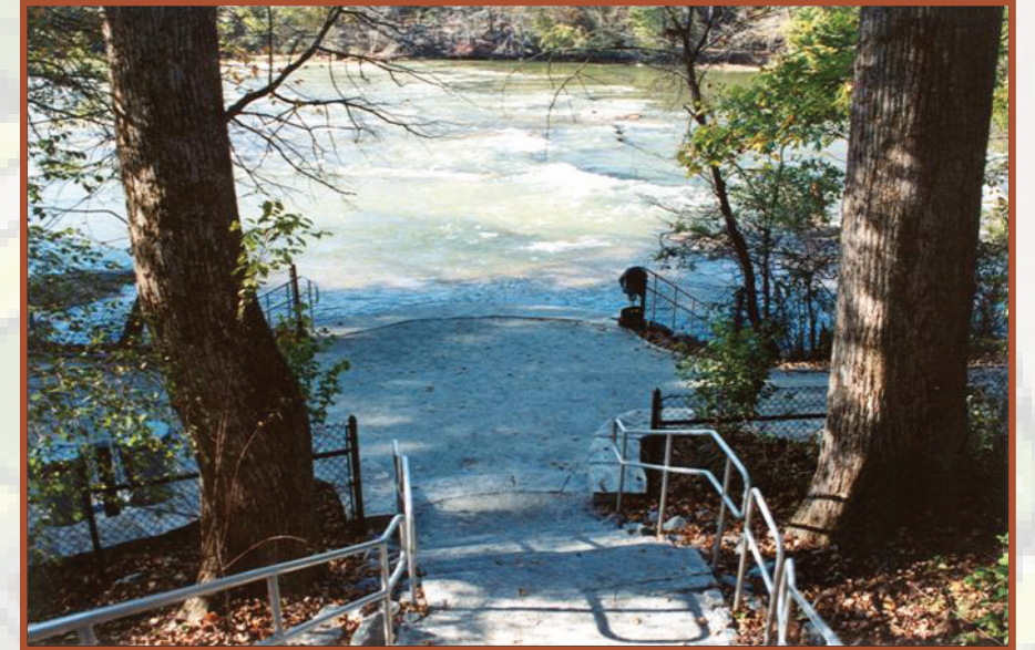
Typical Canoe Landing

The separate river access parcel on Old Muse Road has a large open area that would be best suited for the archery range. During the community input process conducted during the master plan work, there were several requests for the park programs to include