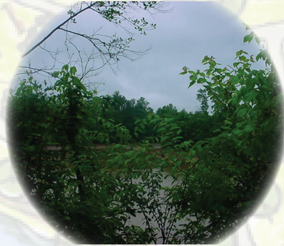
View of existing pond