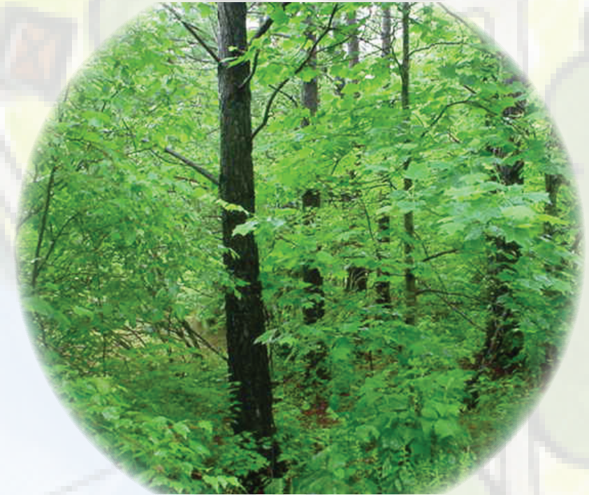
View of typical wooded wetland area