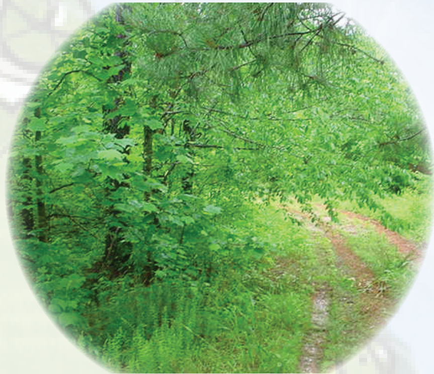
View of existing access road